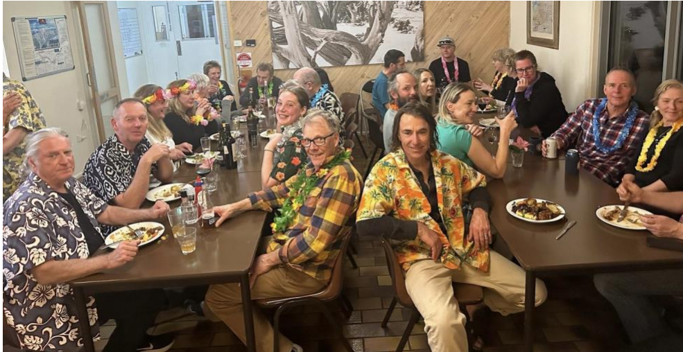
The 2023 Members Weekend Dinner